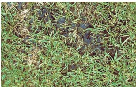
Research trials in Connecticut and Japan suggest that Revolution plays a part in minimizing algae development on highly maintained turf areas. While Revolution does not directly control or prevent algae growth, it can be a useful tool for reducing algae encroachment.